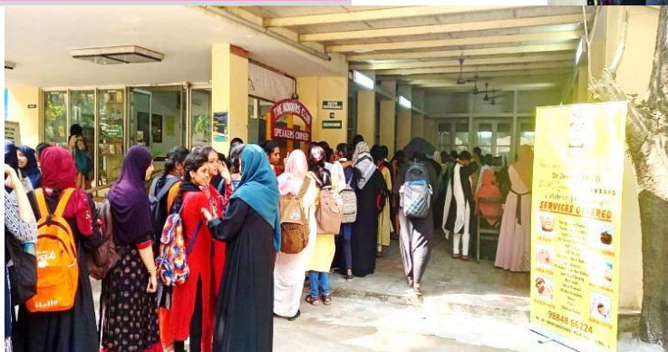
Students at Medical camp