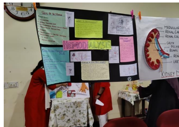
Interdepartmental Model and Poster Competition on Kidney Health - 10 th March